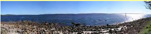
Halifax Park Dive Site

All of our Ladies week-ends have been great trips away, with good diving and lots of laughs.