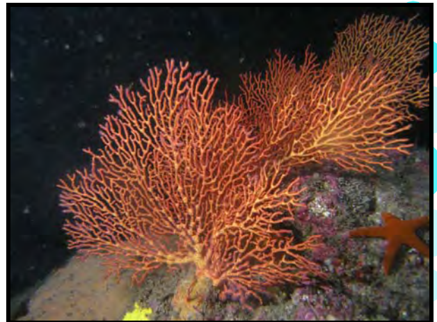
Gorgonian Fans

above. I found a green moray out of his hole and the other two saw a blue devil fish. There were also some nice gorgonian fans on the reef.