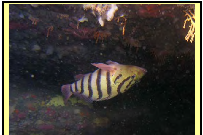
Don't adjust your newsletter! This is a yellow-banded sea perch, rarely seen by divers, due to it's habit of living upside down on the roof of caves.

The deck area has plenty of space for gearing up and the entry and exit is easy using a low board which sits just below the surface. All in all an excellent dive thank you once again to the boat owners for making themselves available.