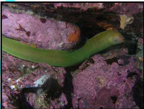
A green moray