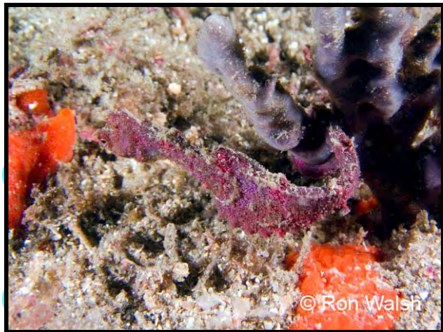
Pygmy pipehorse by Ron Walsh

We followed the wall and the current turned to be behind us, pushing us quite quickly. I found a red Indianfish on the rock and soon after another. Shortly they were everywhere, we saw six all up on the deep wall. We also saw three sea dragons. Strangely, about here the current slowed and shortly after came at us from ahead. It should not be doing this as high tide is not till almost 11 pm. At least it is not too strong.