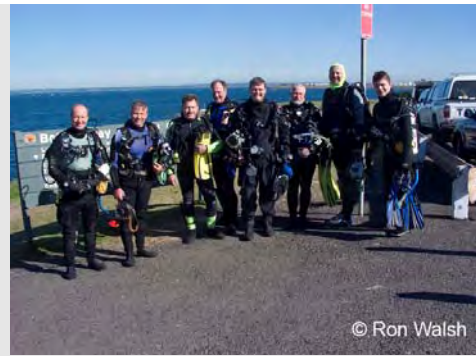
Last year's entrants at Bare Island