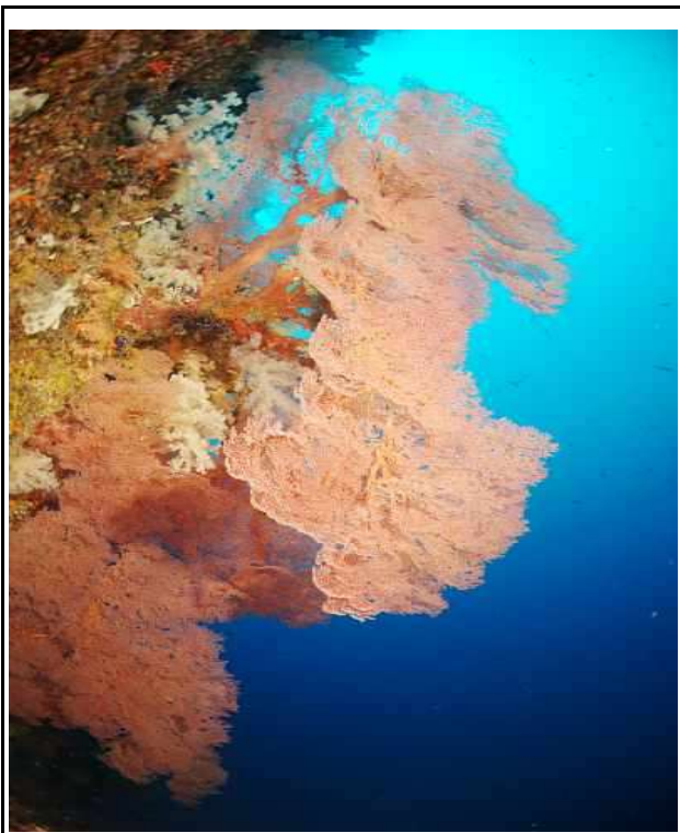
A giant fan at Siaes Wall

Siaes Wall – pretty wall with fans – very blue water – sharks again!, turtles a few schools of pelagics, a bit of a drift dive – very pleasant.