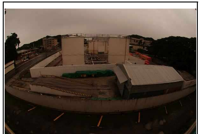
View from the hotel!

The Hotel - West Plaza - Malakal - the rooms were largish, clean, well appointed - not quite what was depicted on the web as a standard room - nor was the Oil Refinery storage depot next door highlighted - made for an unusual view.