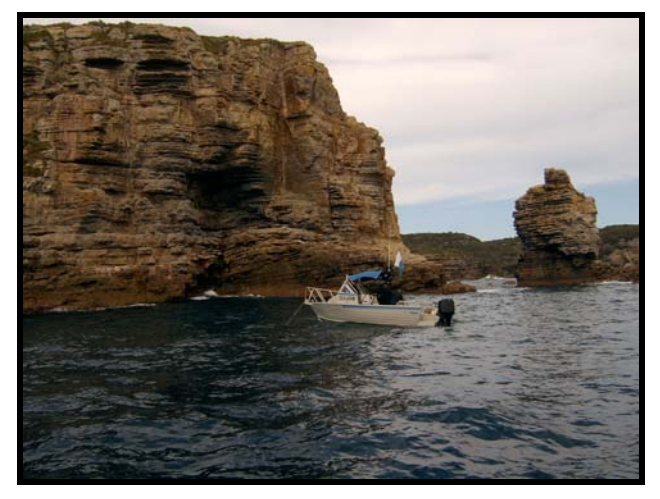
SeaJohn at the Drum & Drumsticks

We anchored just off the wreck of the "Wandra" on the reef. Vis was probably 15 to 20 metres with it deteriorating down to about 10 metres towards the end of our dive.