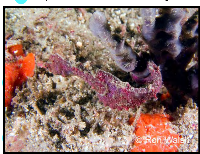
Pygmy pipehorse by Ron Walsh

We followed the wall and the current turned to be behind us, pushing us quite quickly. I found a red Indianfish on the rock and soon after another. Shortly they were everywhere, we saw six all up on the deep wall. We also saw three sea dragons. Strangely, about here the current slowed and shortly after came at us from ahead. It should not be doing this as high tide is not till almost 11 pm. At least it is not too strong.