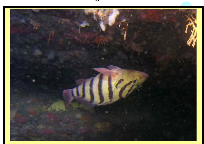
Don't adjust your newsletter! This is a yellow-banded sea perch, rarely seen by divers, due to it's habit of living upside down on the roof of caves.

The deck area has plenty of space for gearing up and the entry and exit is easy using a low board which sits just below the surface. All in all an excellent dive thank you once again to the boat owners for making themselves available.