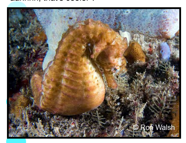
Big Belly Sea horse

We head off down the goat track on the cliff face arriving soon after dripping with even more sweat. The swell was ok and one by one we take a giant leap into the abyss. Bobbing back up to the surface the first thing said was "aahhhh, that's cooler".