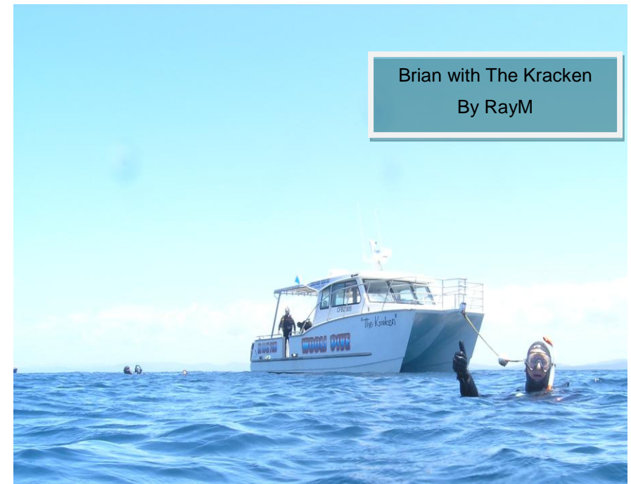
Brian with The Kracken By RayM

7 Days of diving, 12 Divers, we were all feeling positive and looking forward to a week of awesome diving