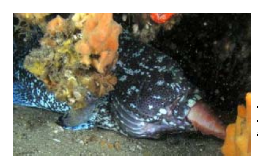
Sea Perch being Codgolloped! By Eddie Ivers