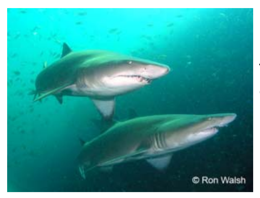
Grey Nurse Sharks.

Location was the shallow entrance at Fish Rock Cave, South West Rocks.