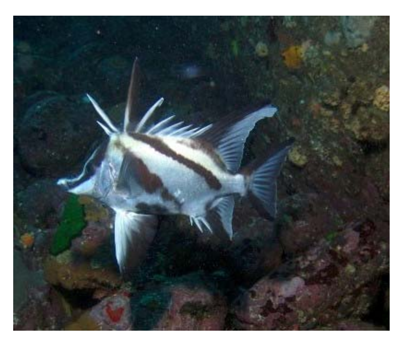
Boarfish