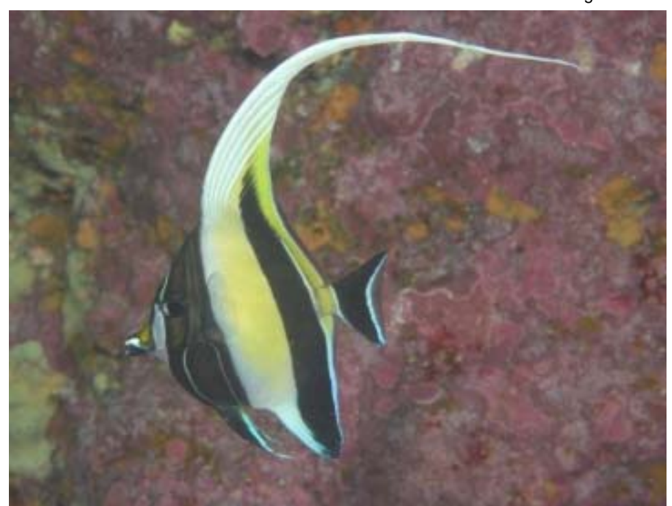
Moorish Idol