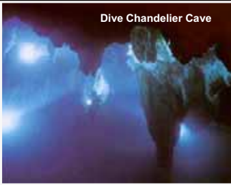
Dive Chandelier Cave