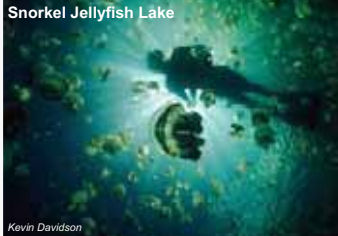
Snorkel Jellyfish Lake