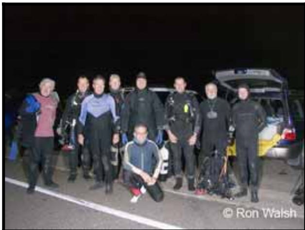
Members at Bare Island for a night dive – August 2007