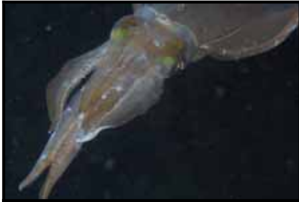
Some of Peter T photos from a recent night dive.

After some poor weather night dives are back.