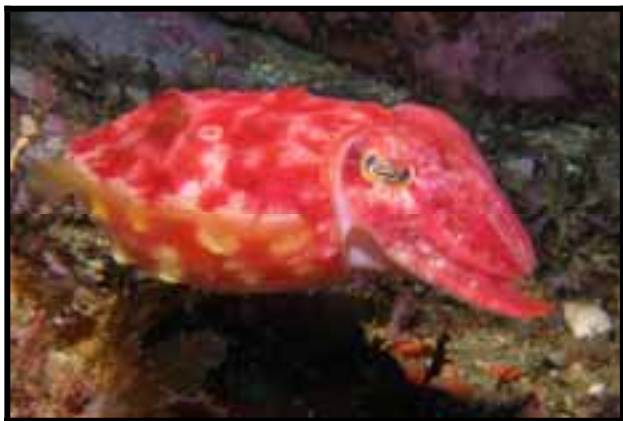
Reaper Cuttlefish

There was an interesting group of divers on board. Most were from Canberra. But there were also some from the Ryde Underwater Club and two from the UTS diving club (DOUTS), along with the two of us from St George.