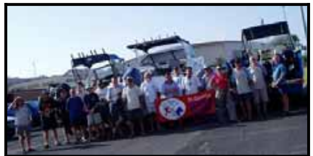
Shellharbour weekend saw members and boats out in force – February 2007

Our annual Christmas Party for members and their families was held in early December, with more than 50 members and family enjoying a feast of cold meats and salads.