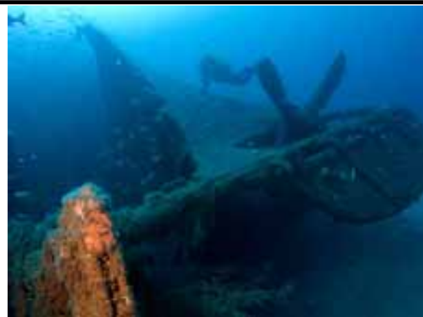
Here's photo from a recent deep dive on the Tuggerah with 30m+ vis