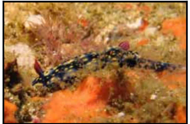
Hypselodoris Nudibranch