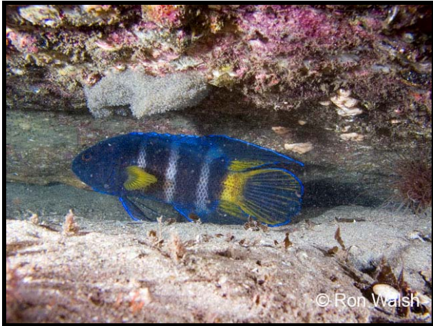
Note the eggs above the Blue Devil fish which it was protecting

Oak Park is a great dive for people who like to see lots of interesting underwater life among its rocks, reefs and overhangs. From tiny, active brittle stars to the really big Giant Cuttlefish hovering near the divers, the dive was endlessly fascinating.