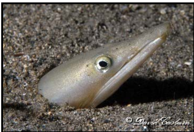
Serpent eel from a recent Night Dive at The Monument