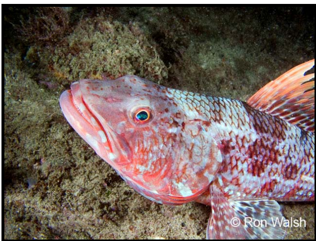
Sergeant Baker

The half-way mark was notable for its very large flathead, well camouflaged with the sand. On the way back we came across an octopus, determinedly trying to be part of the reef it had latched on to. And just near the end was a large and impassive Sergeant Baker perched on its pectoral fins.