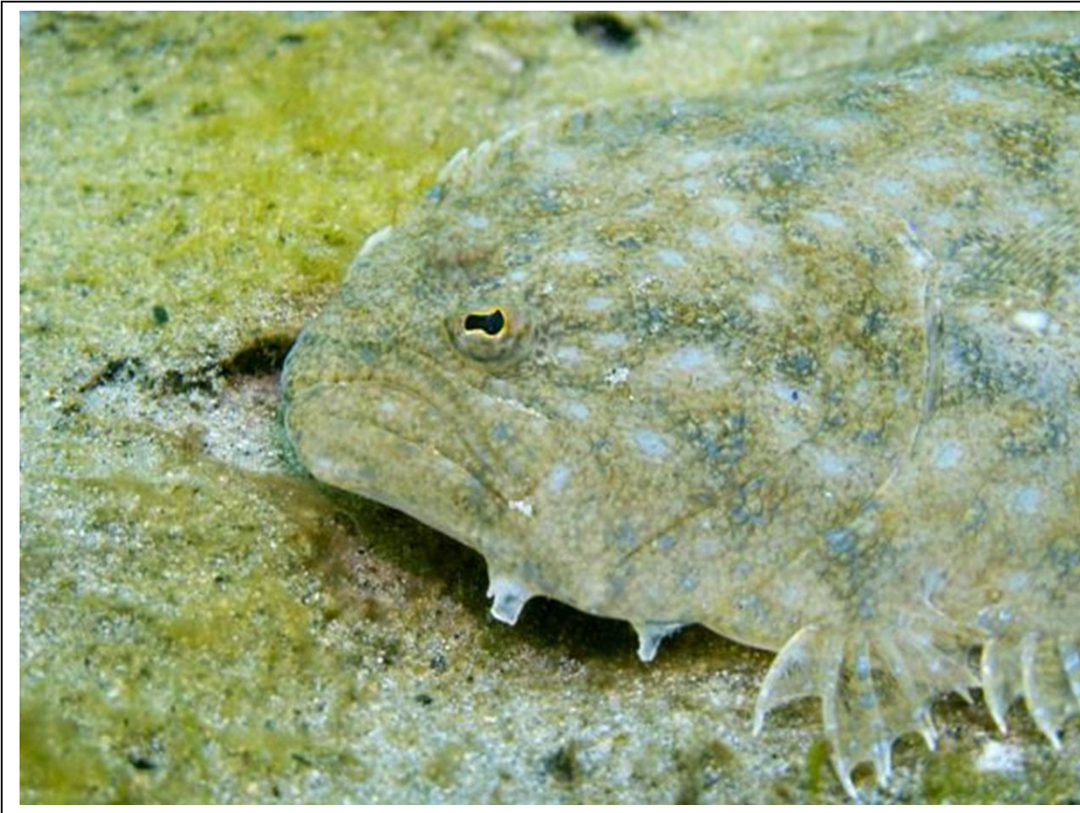
From Gary DUNNETT at Shiprock - Flounder