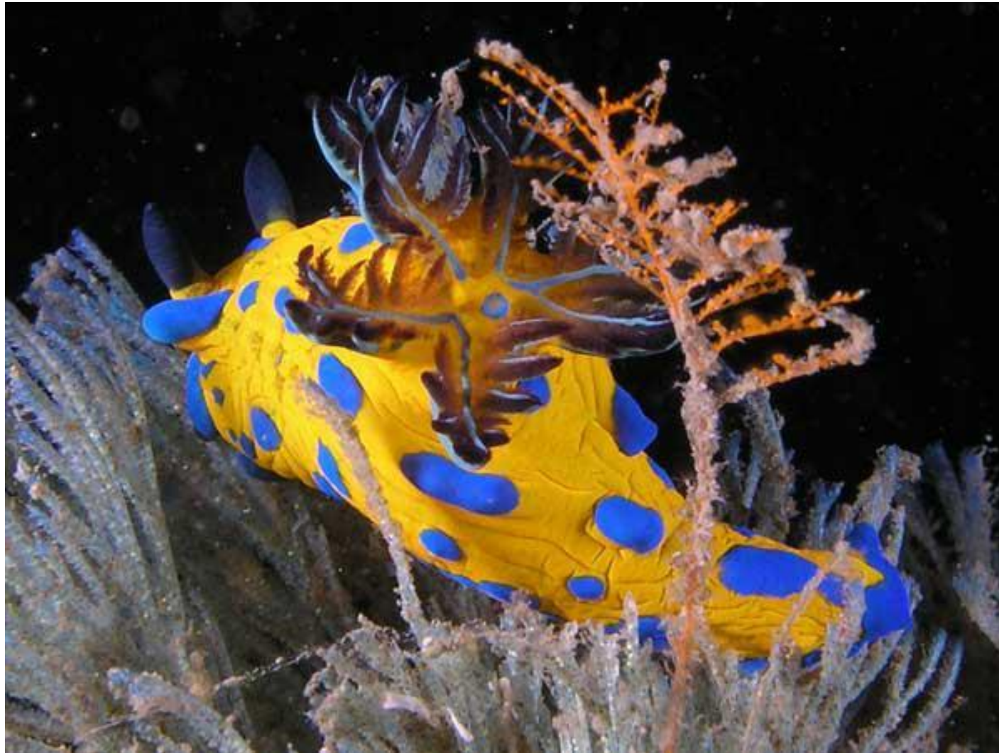
Vercos tambja on top of a fishing float