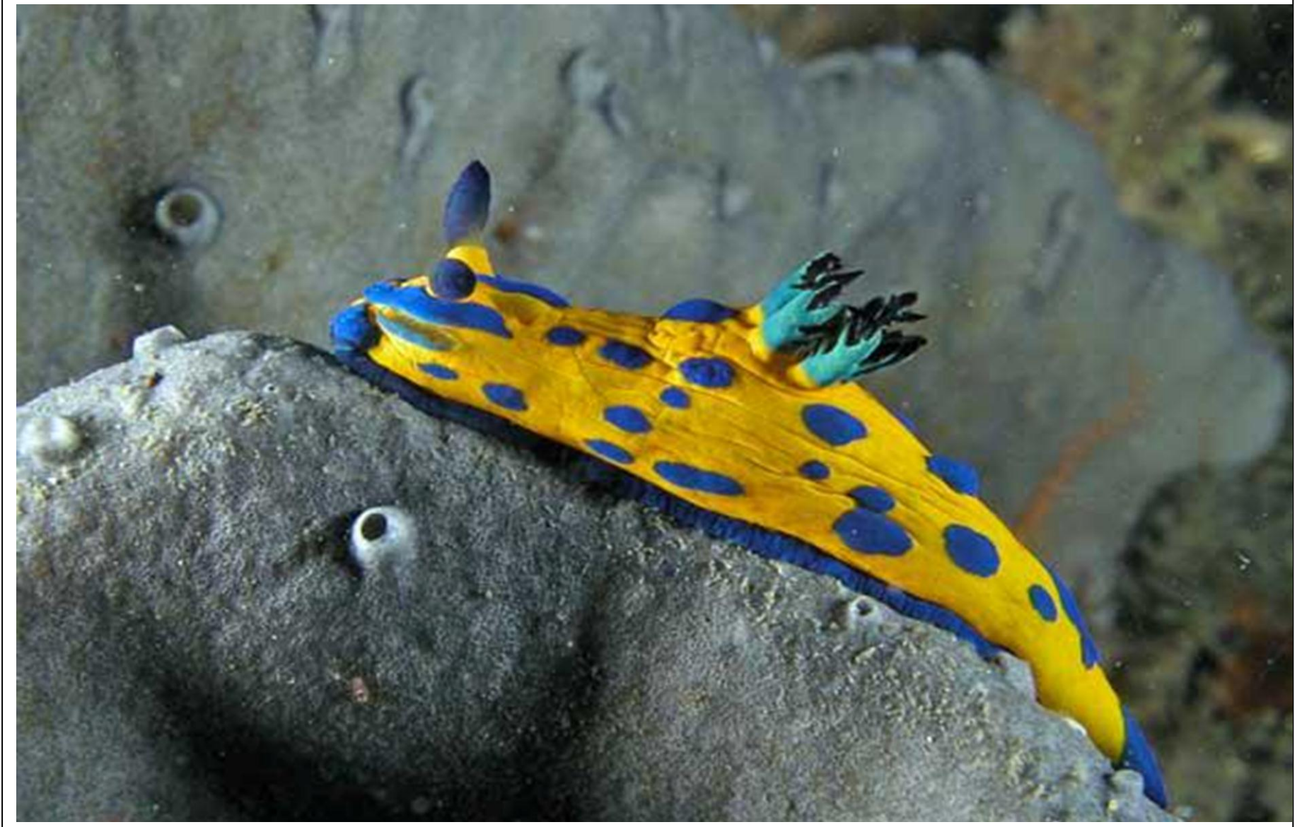
Another Vercos tambja, Bare Island Isolated Reefs