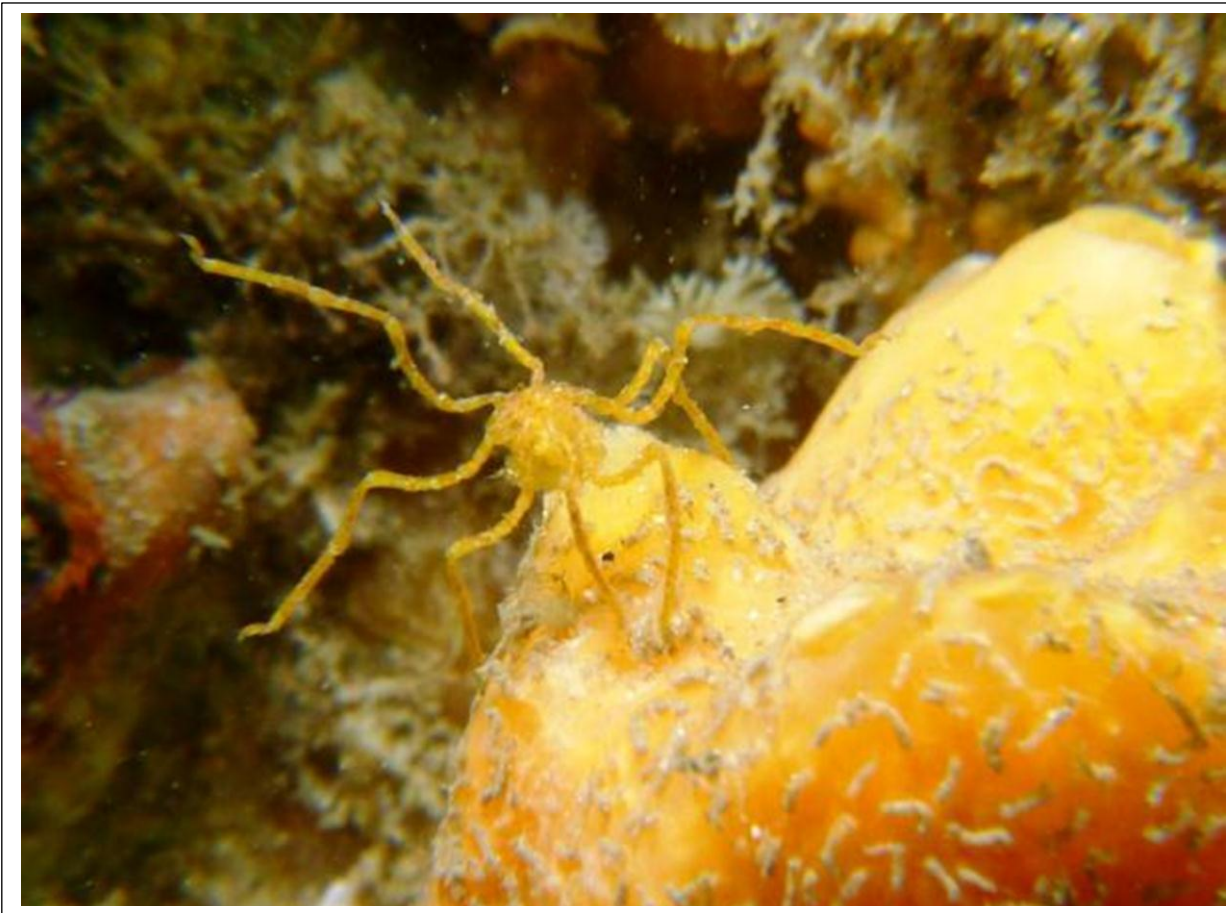
From Roxy Fea at Fly Point. No MCIDA