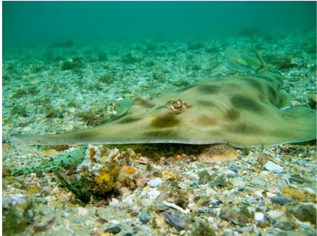
Shovel nosed shark