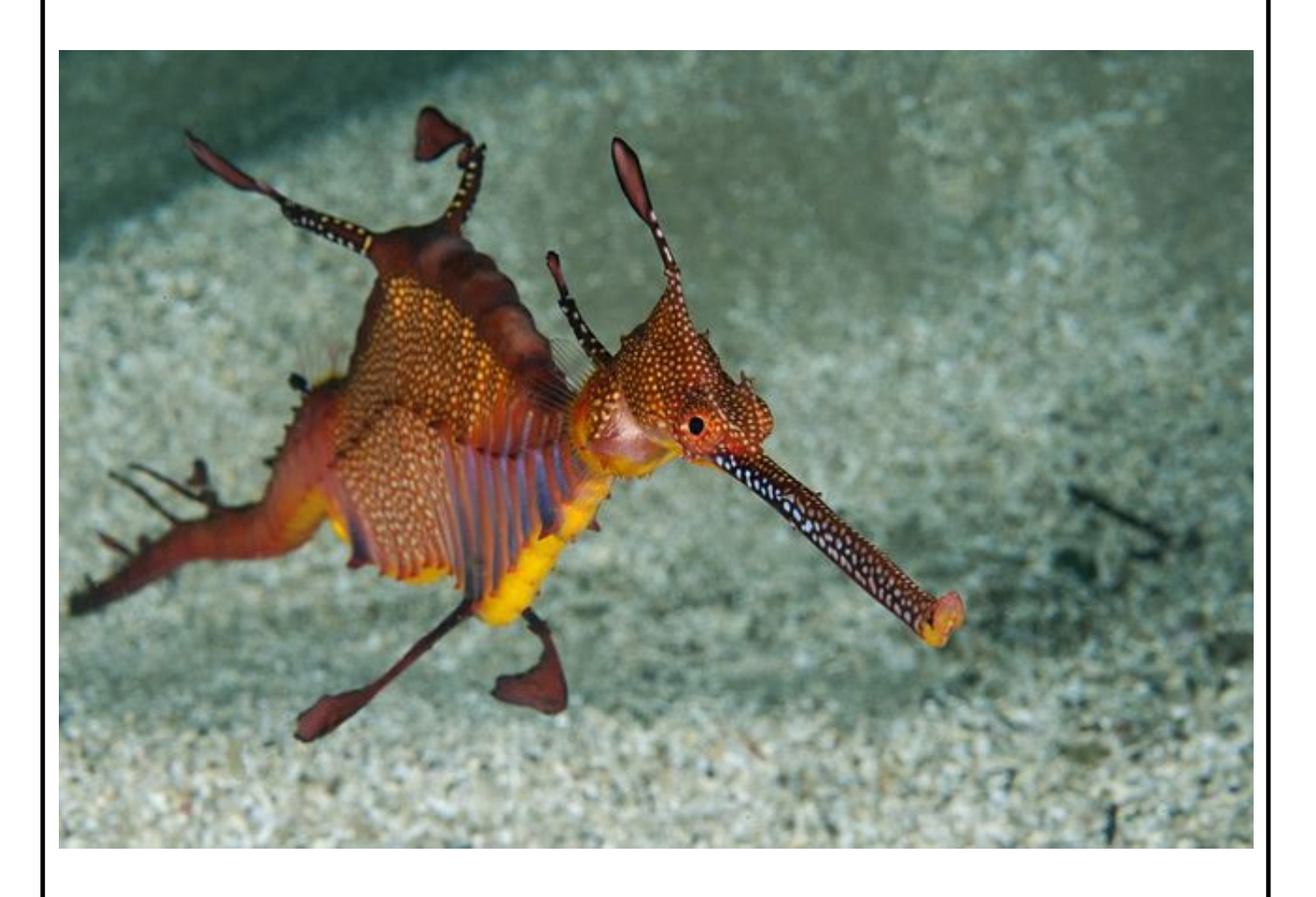
Weedy Seadragon, The Leap, Kurnell