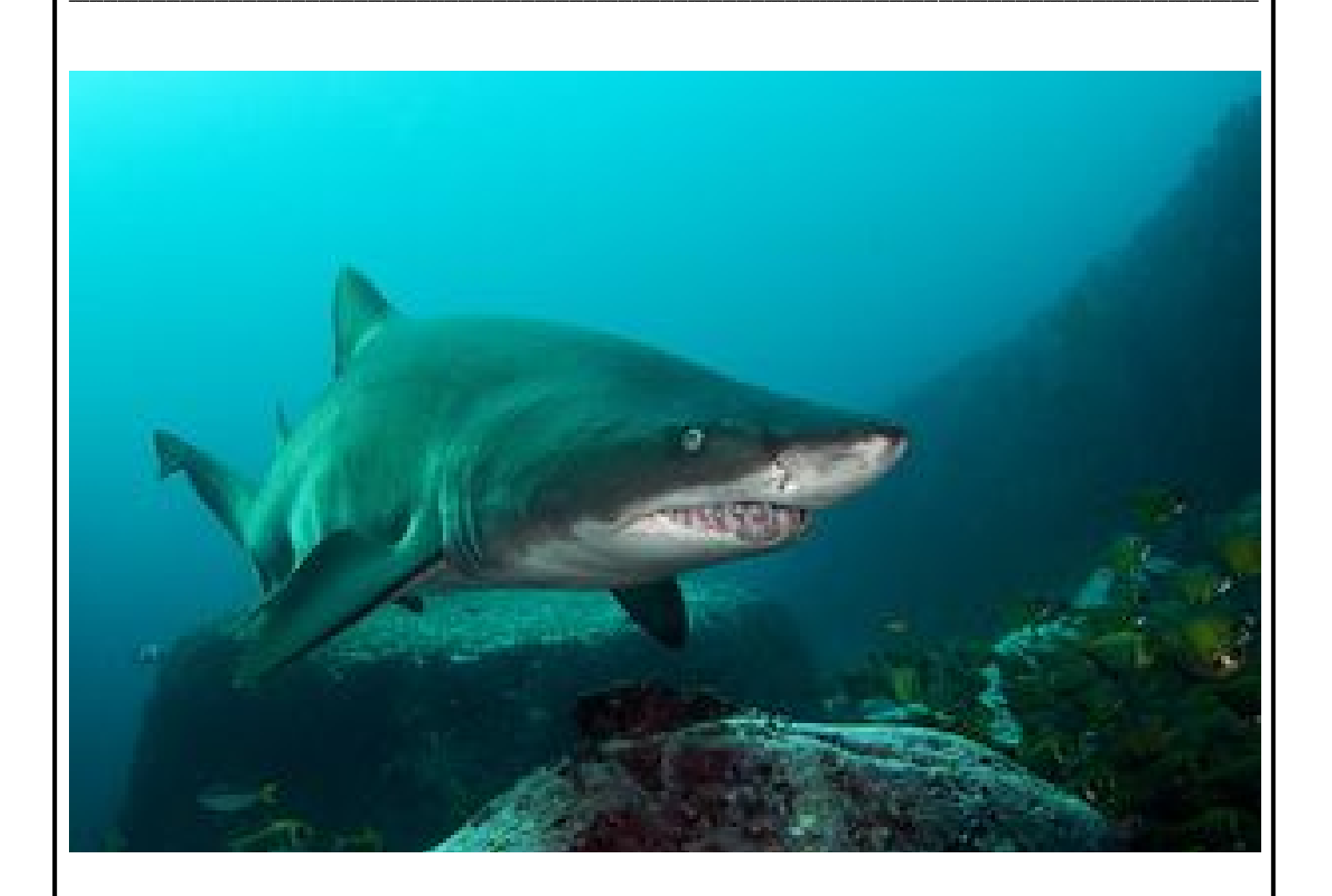
Grey Nurse Shark, North Rock, Broughton Island