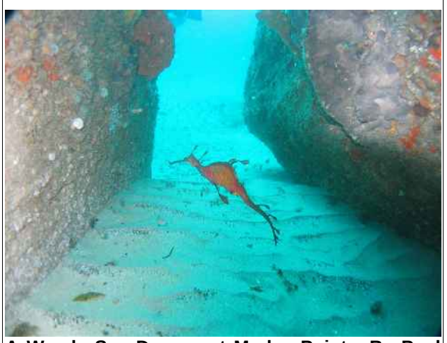
A Weedy Sea Dragon at Marley Point

I have only dived here once before and that is a shame because it is such a nice dive site – particularly if you like a real cruisey dive with lots of swim-throughs and cave-like sections to explore, as I do.