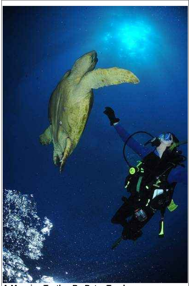
A Massive Turtle

The site called the Manta Bommie was great and only a 10 minute run from the moorings. I saw a couple Mantas, one other group saw 15 mantas at one time. At the Manta bommie we were buzzed by the friendliest, biggest turtle I have had the pleasure of meeting and photographing. After that dive we were all on a high from a very special close encounter with a very friendly old turtle, who I suspect was as curious about us as we were about him.