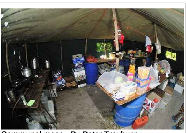
Communal mess - By Peter Trayhurn

dinner at the yacht club and the ferry left at 11pm. On the barge we had 2 rubber duckies, 8 x 200 litre blue plastics drums of water, 6 x 150 litre drums of unleaded, 2 compressors and the group's camping gear as well as a huge amount of communal food. Leaving Gladstone harbour at night was spectacular. The sleep on the deck was comfortable and dry. I awoke to a stunning sunrise and Musgrave Island. Unloading the barge and setting up the camp was hard work which deserved nice cold icecream which must have been enjoyed because the 2 litres disappeared very quickly at the hands of the hungry hoarde.