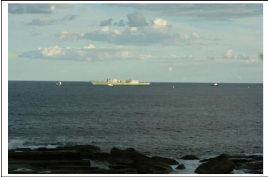
Ex HMAS Adelaide Impending Sinking