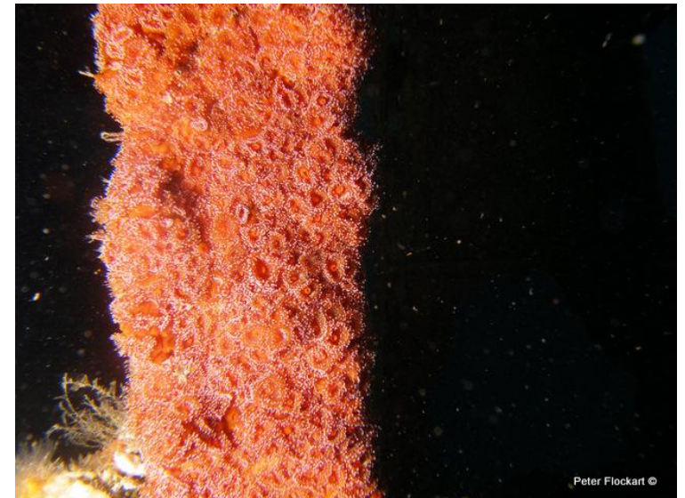
Beautiful Jewel Anenomes - Peter Flockart

The cabling and pipework in the engine room are covered in Jewel Anenomes and they come in a variety of colours which is pretty neat. From the front of the engine room you go up a stairway through a hatch to a deck below the bridge. Here there are a number of rooms and the usual toilet. There are many more Jewel Anenomes here and it seems that they thrive on the electrical cables hanging from the roof. These Anenomes alone make the Tasman Hauler a fantastic dive.