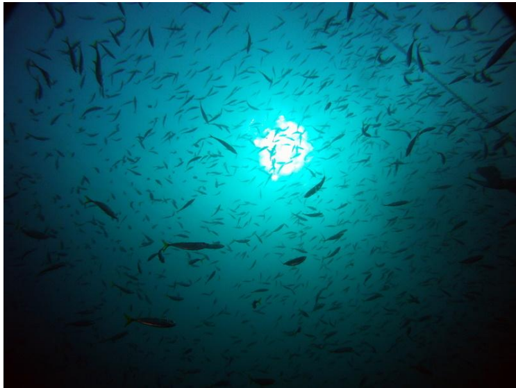
Very Fishy - Nick Ridis

Nonetheless, the cave is large and beautifully decorated with a garden of small gorgonians at the entrance.