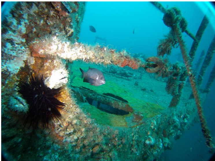
Check out the viz - Nick Ridis

The wreck sits almost upright on a sandy bottom at 30 metres with the propeller and its thrust housing easily accessible.