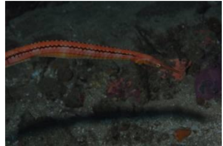
Spiny Pipehorse