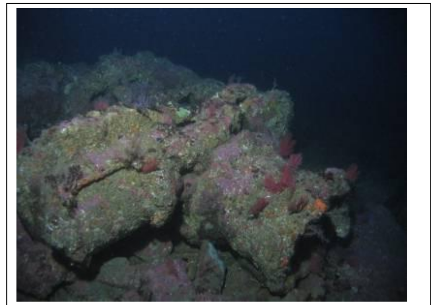
Myola Pictures from Gary Perkins