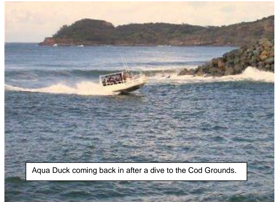
Aqua Duck coming back in after a dive to the Cod Grounds.

Peter decided that our first dive would be to The Maze. The sea was green and our worst fears were confirmed when we hit the anchor in 5 metres of viz.