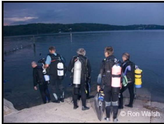
Photos are from recent night dive at Lilli Pilli.

Club night dives continue to be very popular with an average of more than 10 divers every week. The record stands at 15 divers!