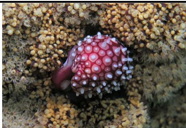
A couple of colourful egg cowries

We made our way along the top of the reef. There were a number of overhangs packed with fish and a couple of giant cuttlefish.